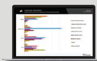
Seventeen fully editable and customisable PowerPoint slides with directional insights.