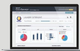
An Infoboard of diagnostic and actionable insights.

Every automated study comes with a robust, real-time reporting suite: